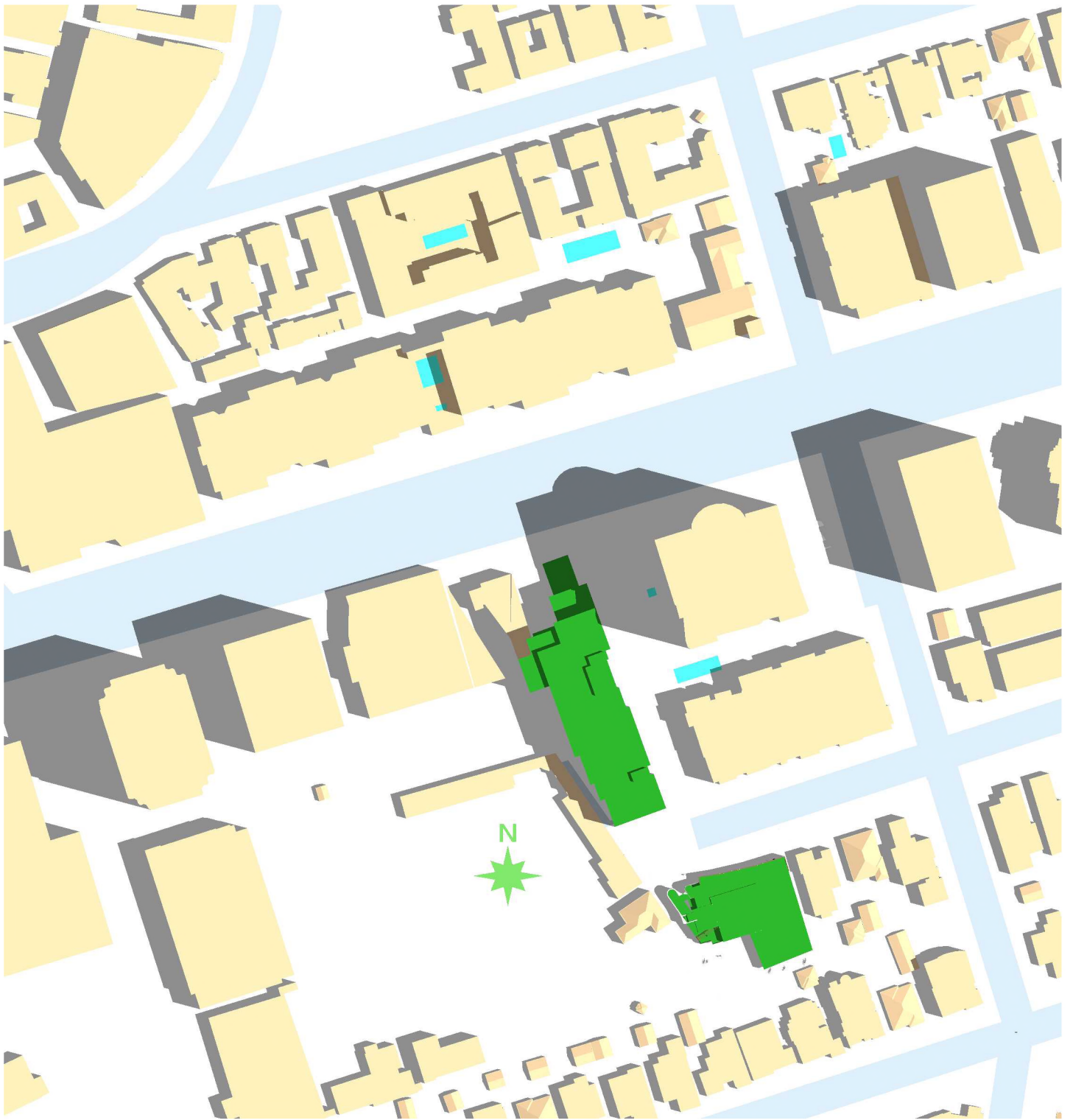
Summer Solstice Shading Diagram 10 a.m.