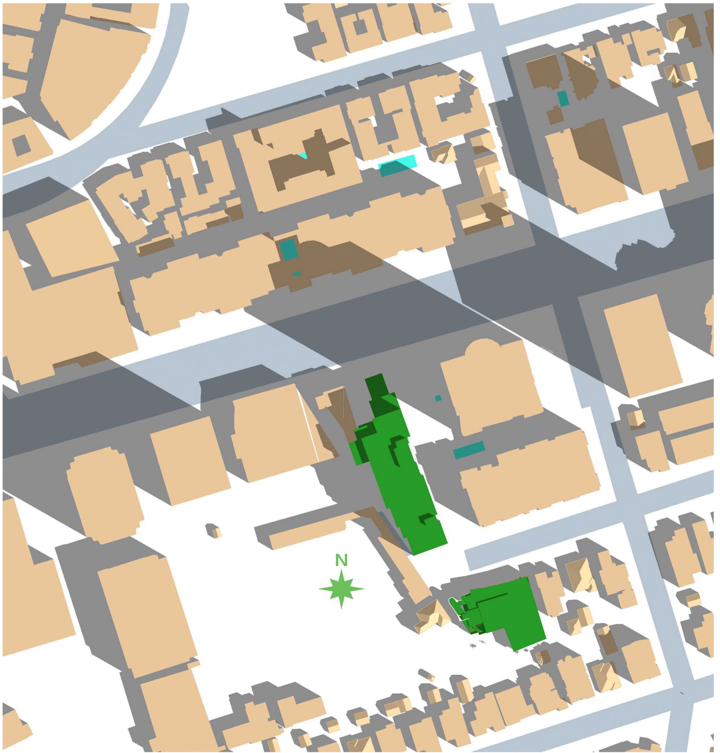
Vernal/Autumnal Equinox Shading Diagram 9 a.m.