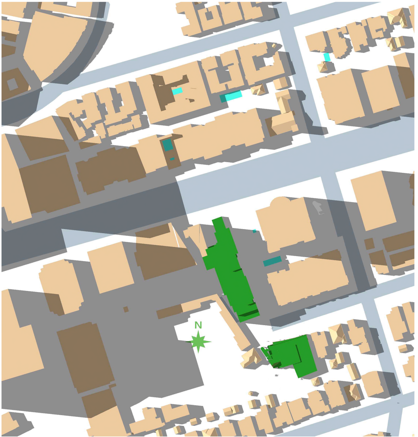
Summer Solstice Shading Diagram 4 p.m.