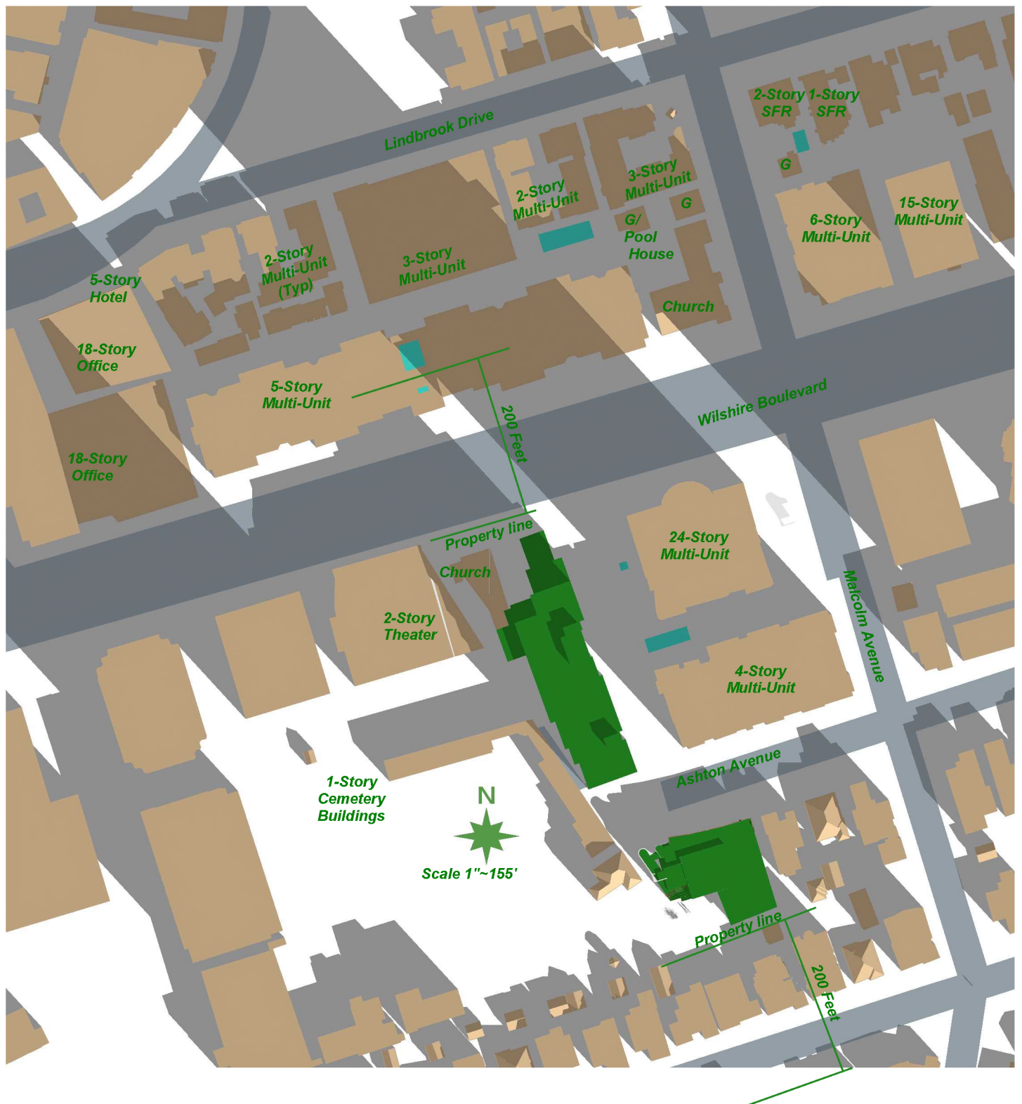
Winter Solstice Shading Diagram 9 a.m.