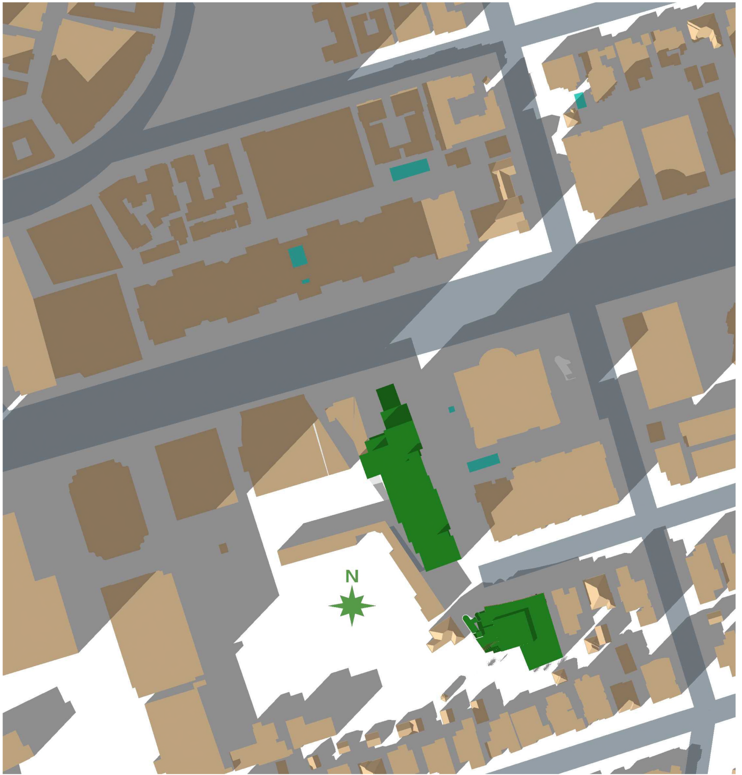
Winter Solstice Shading Diagram 3 p.m.