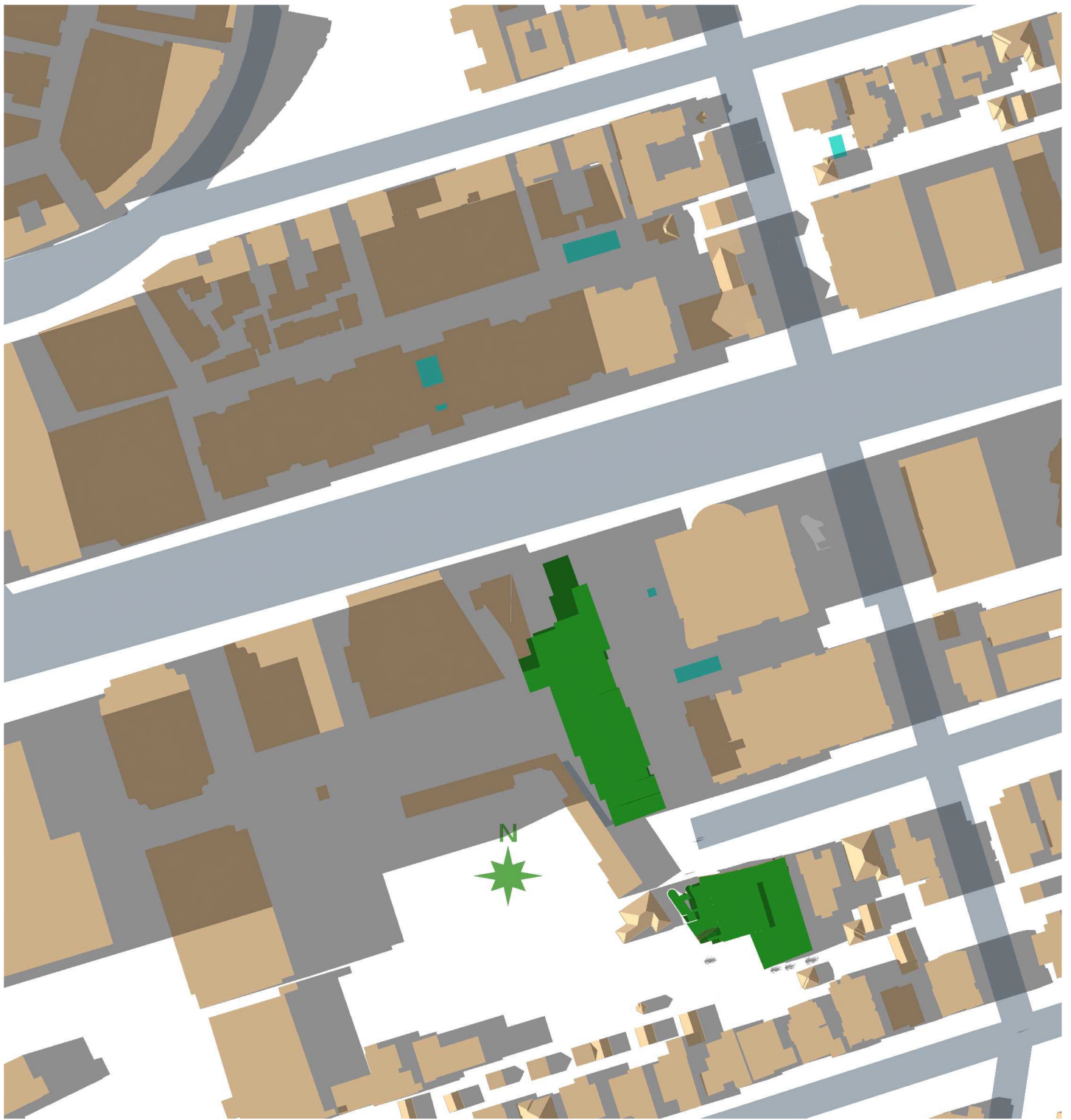
Vernal/Autumnal Equinox Shading Diagram 4 p.m.