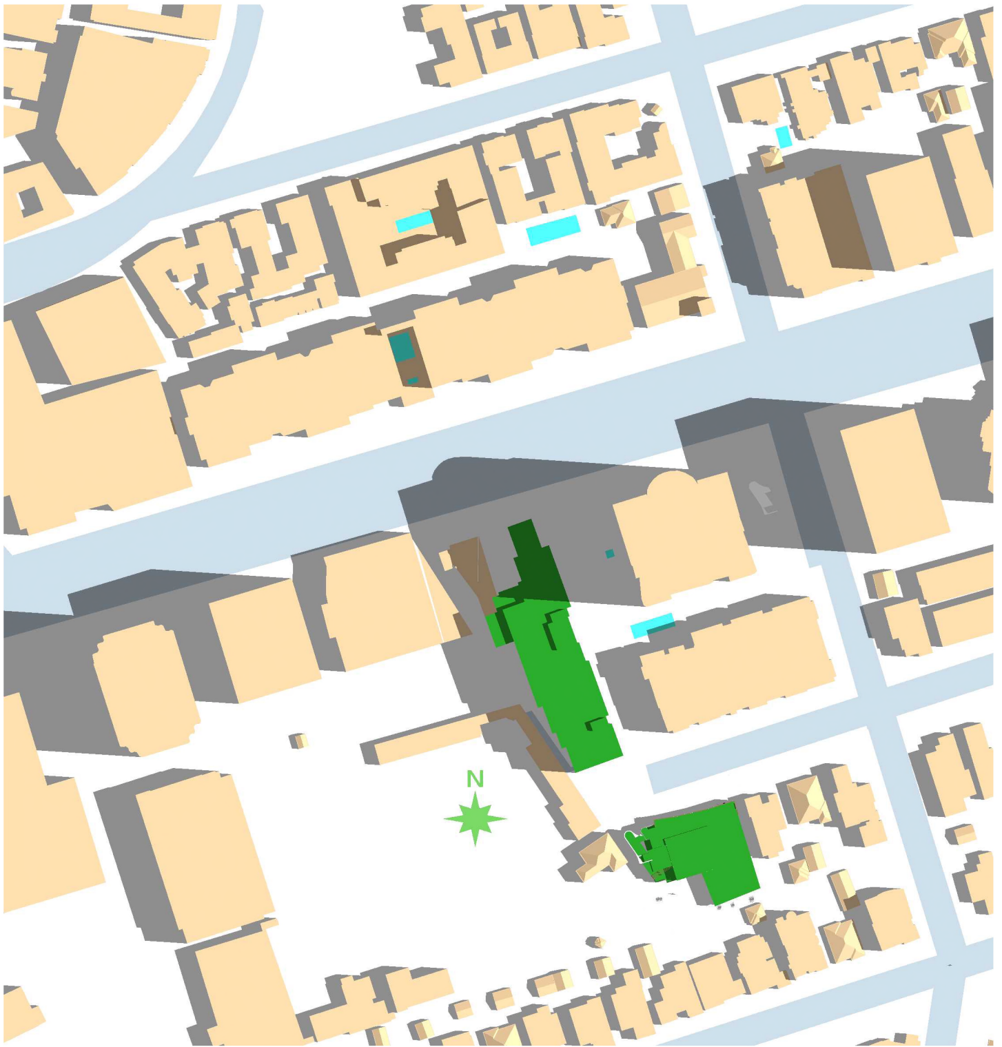
Summer Solstice Shading Diagram 9 a.m.