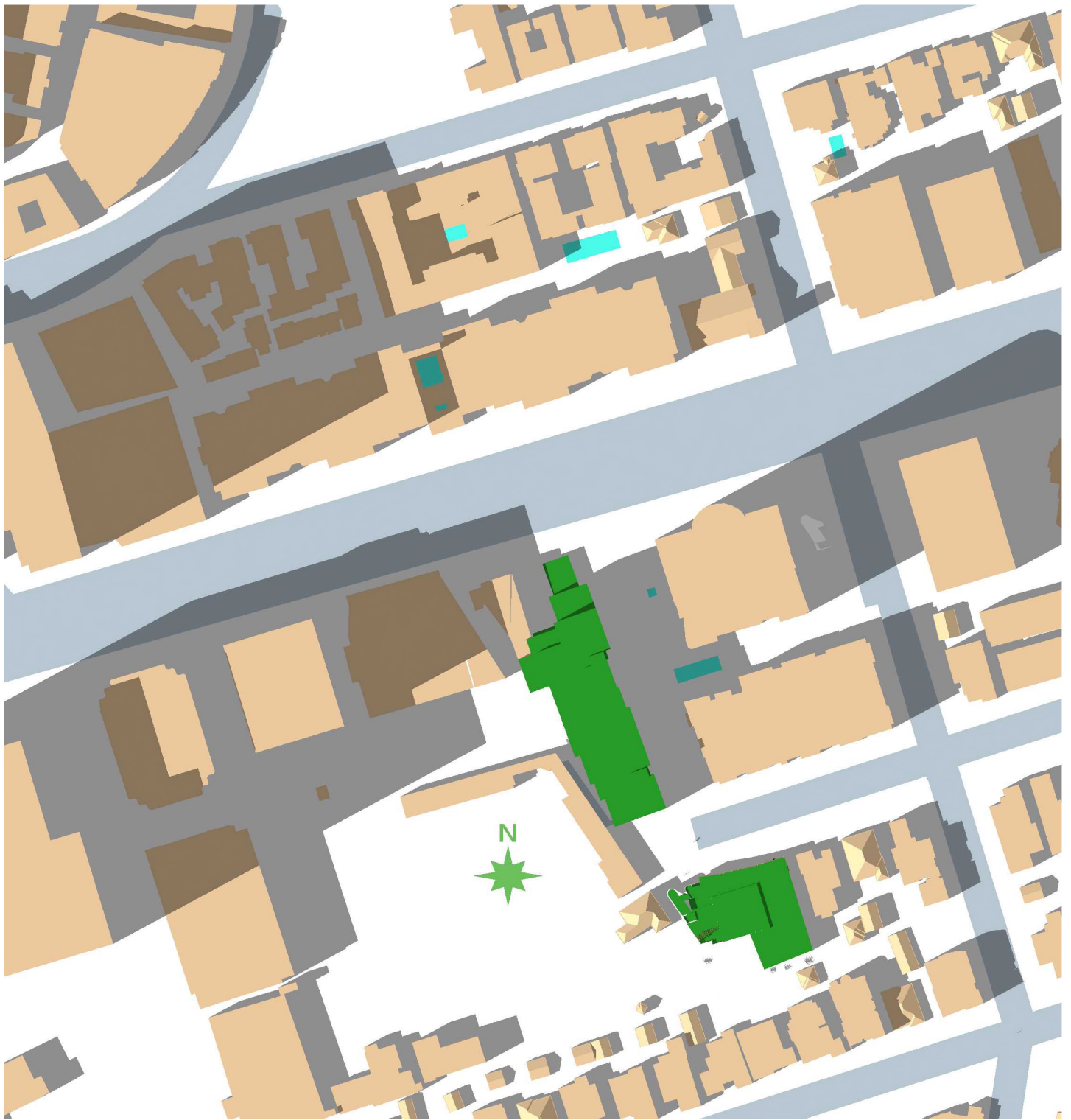
Vernal/Autumnal Equinox Shading Diagram 2 p.m.