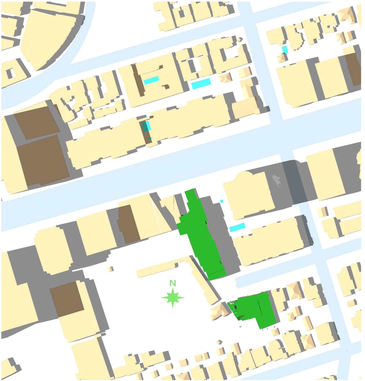
Summer Solstice Shading Diagram 2 p.m.