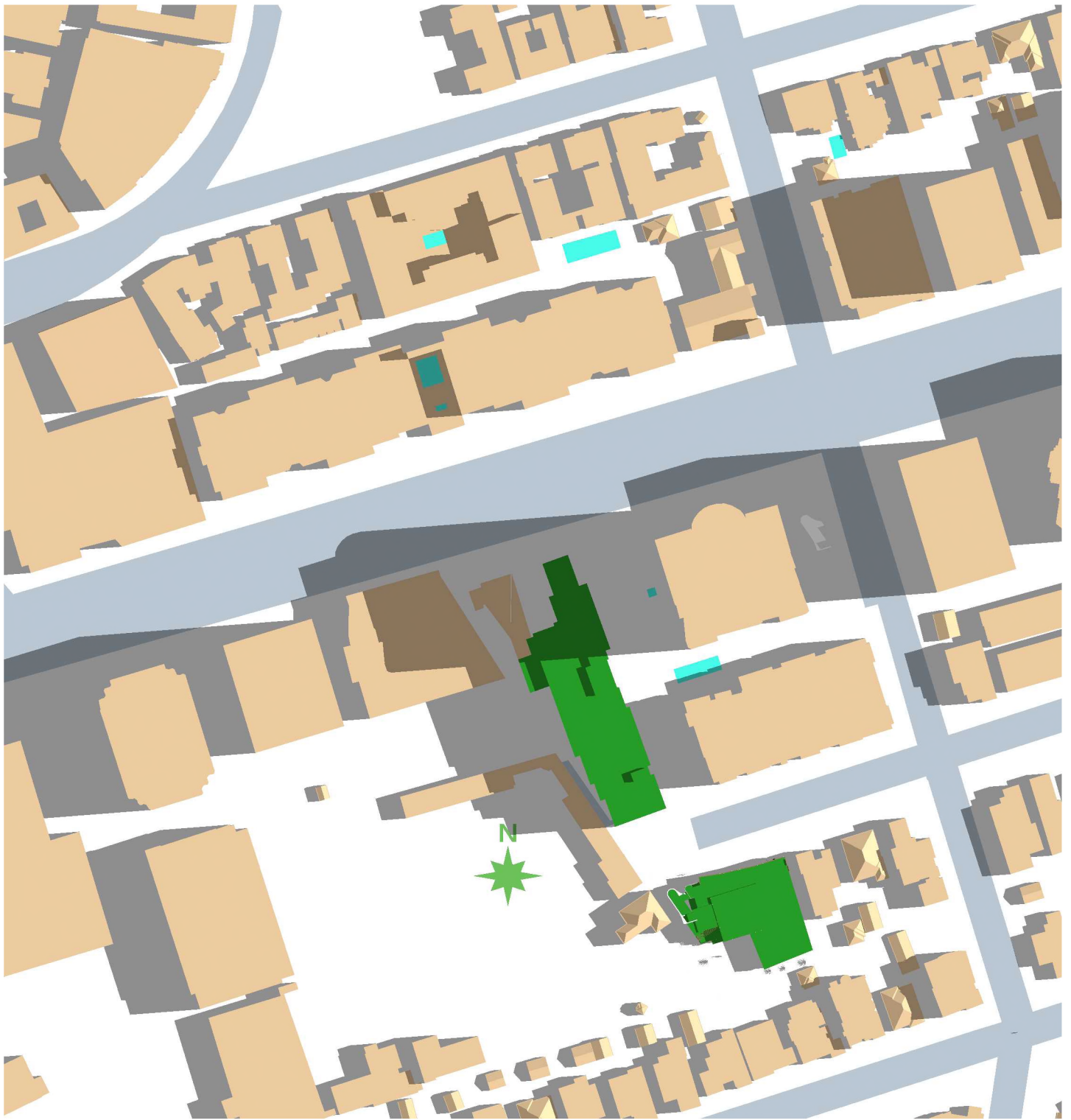
Summer Solstice Shading Diagram 8 a.m.