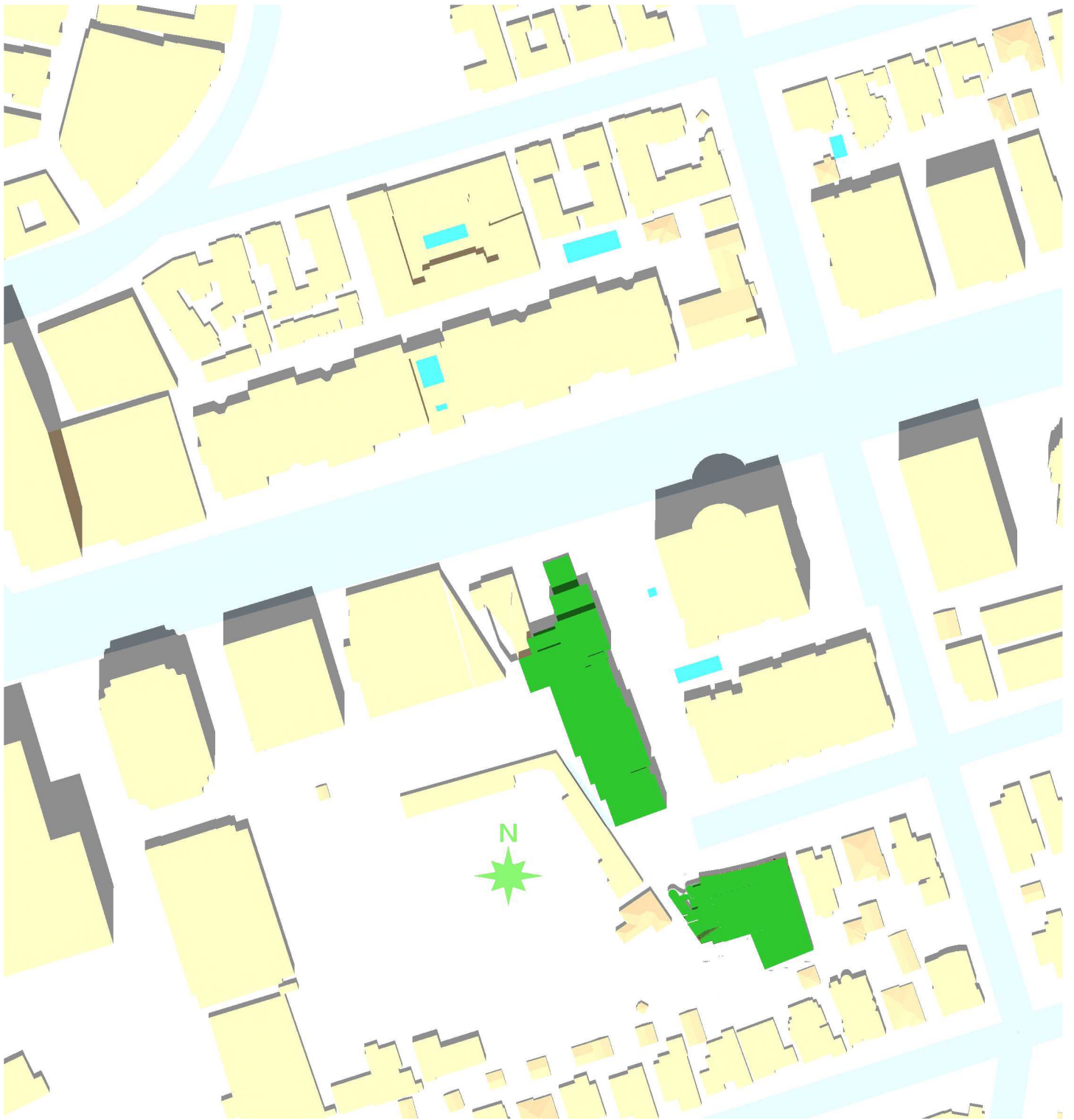
Summer Solstice Shading Diagram Noon