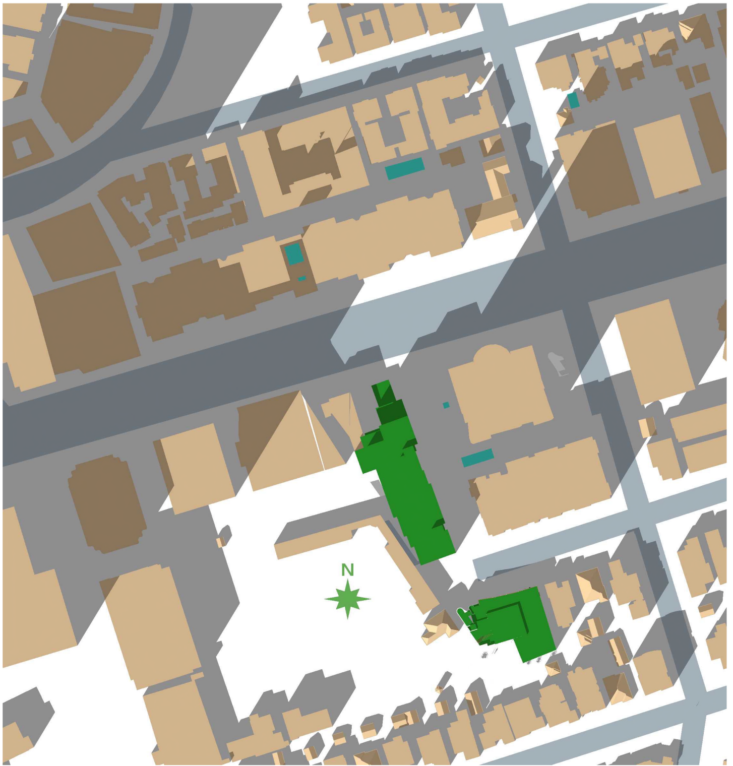
Winter Solstice Shading Diagram 2 p.m.