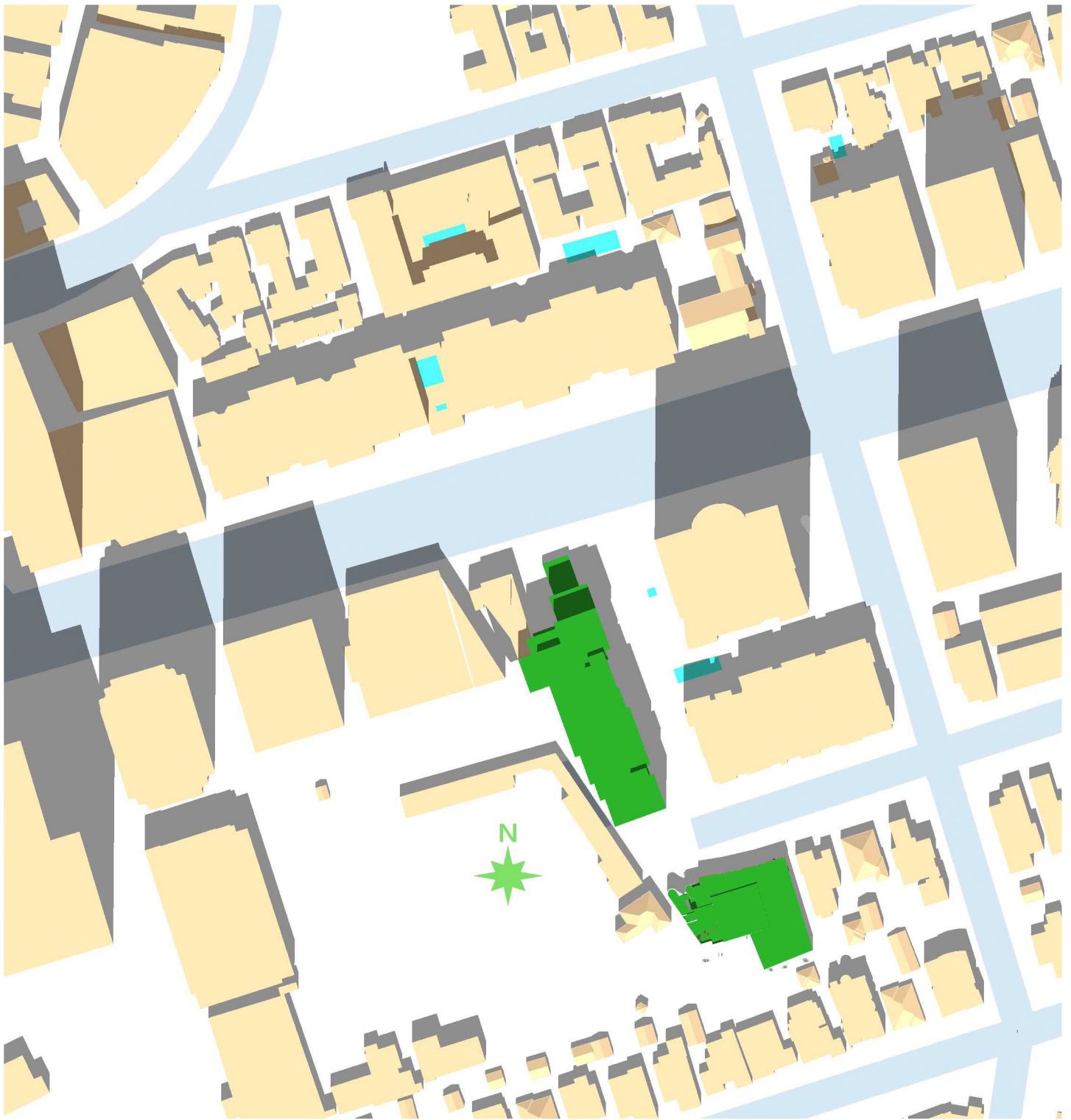
Vernal/Autumnal Equinox Shading Diagram Noon