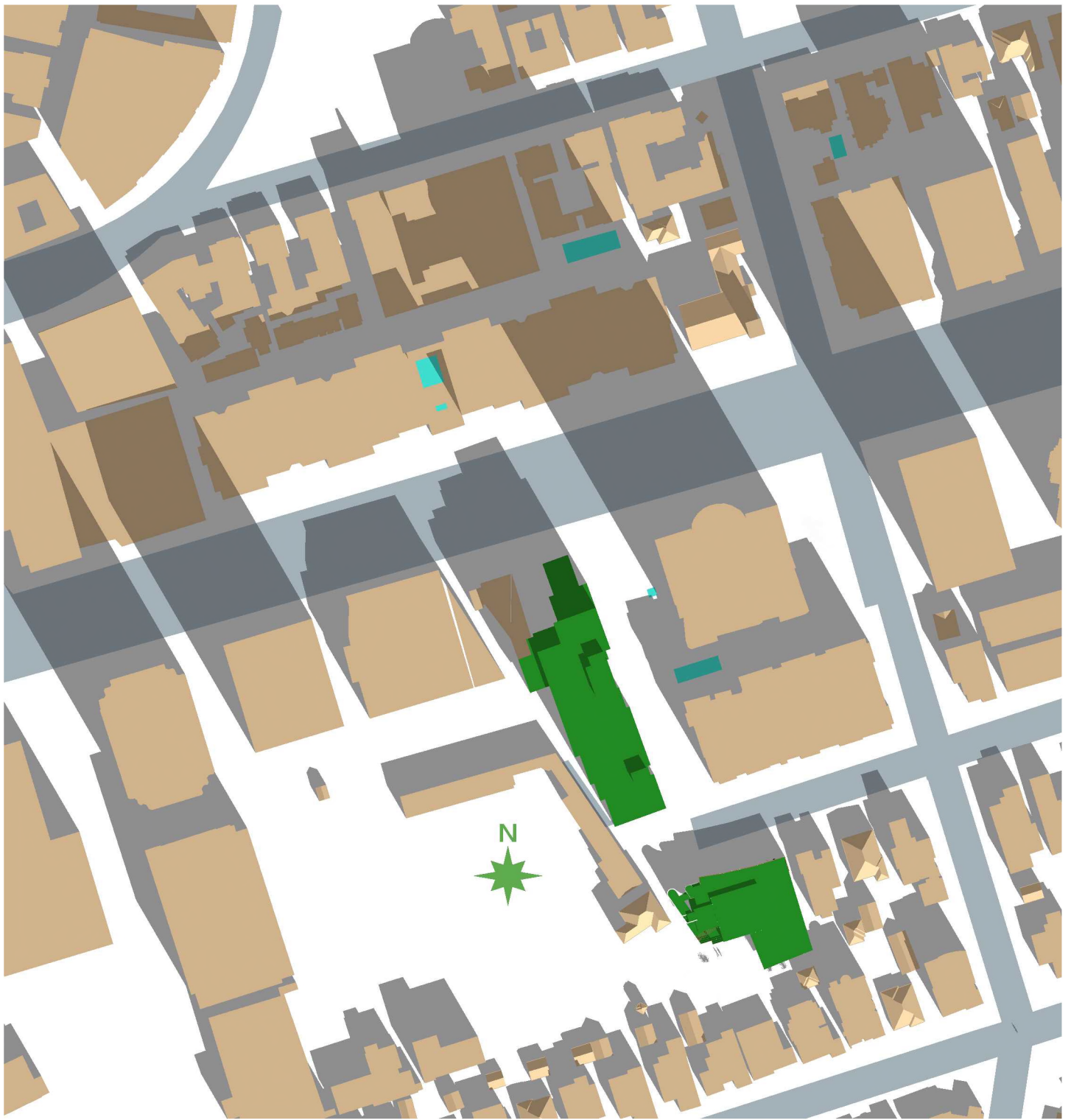
Winter Solstice Shading Diagram 10 a.m.