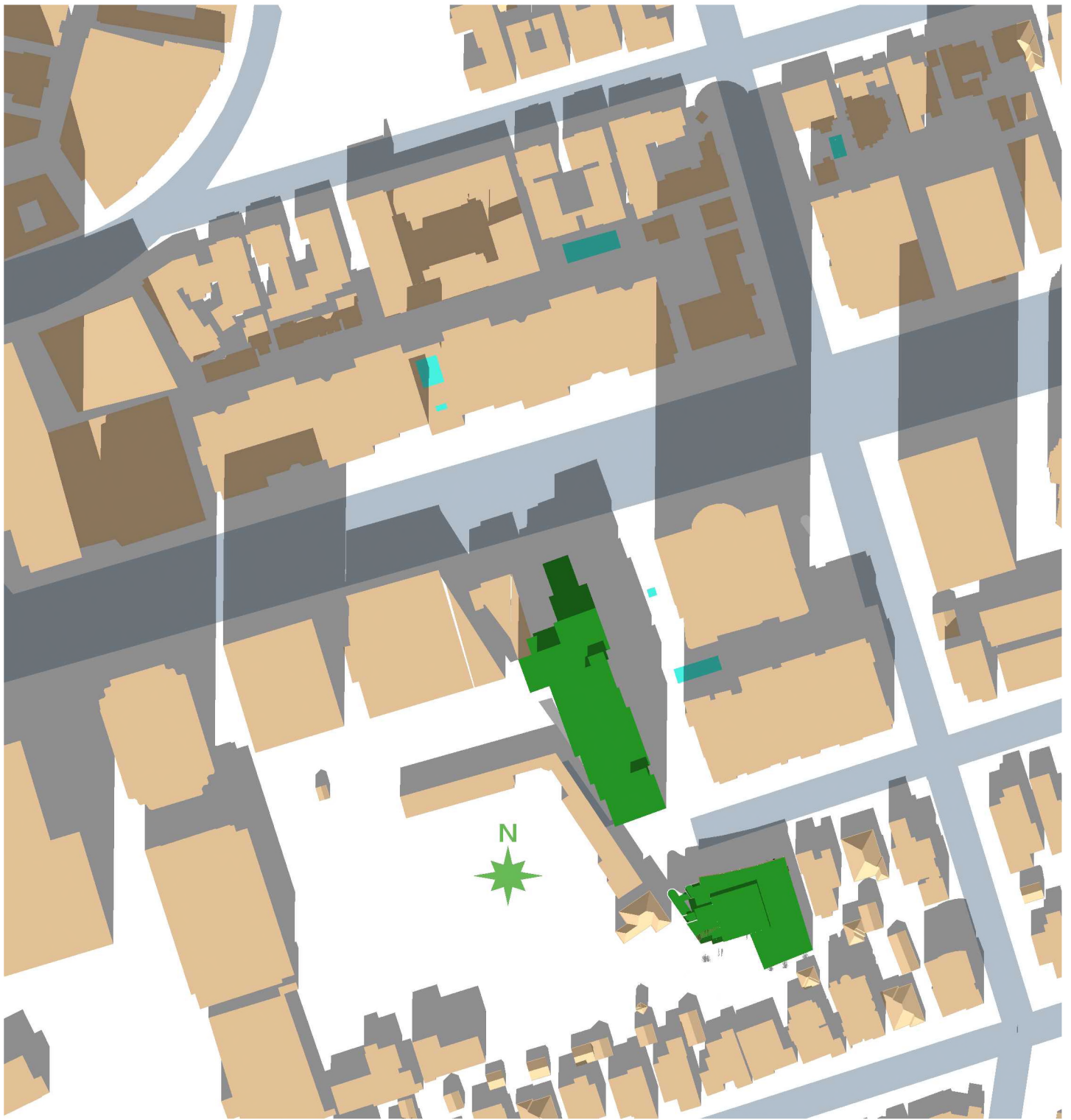
Winter Solstice Shading Diagram Noon