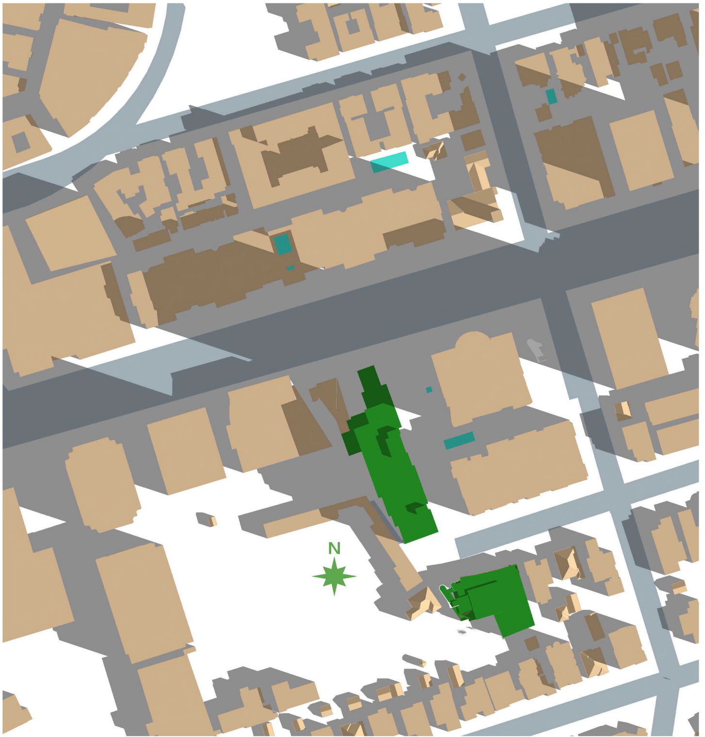
Vernal/Autumnal Equinox Shading Diagram 8 a.m.