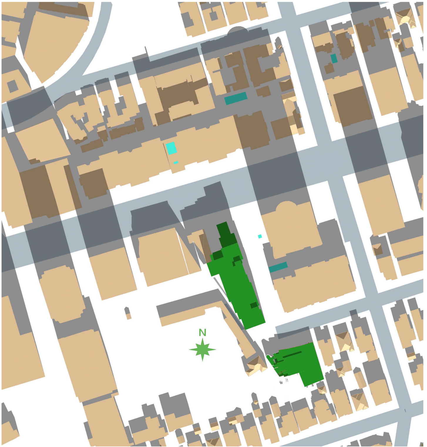
Winter Solstice Shading Diagram 11 a.m.