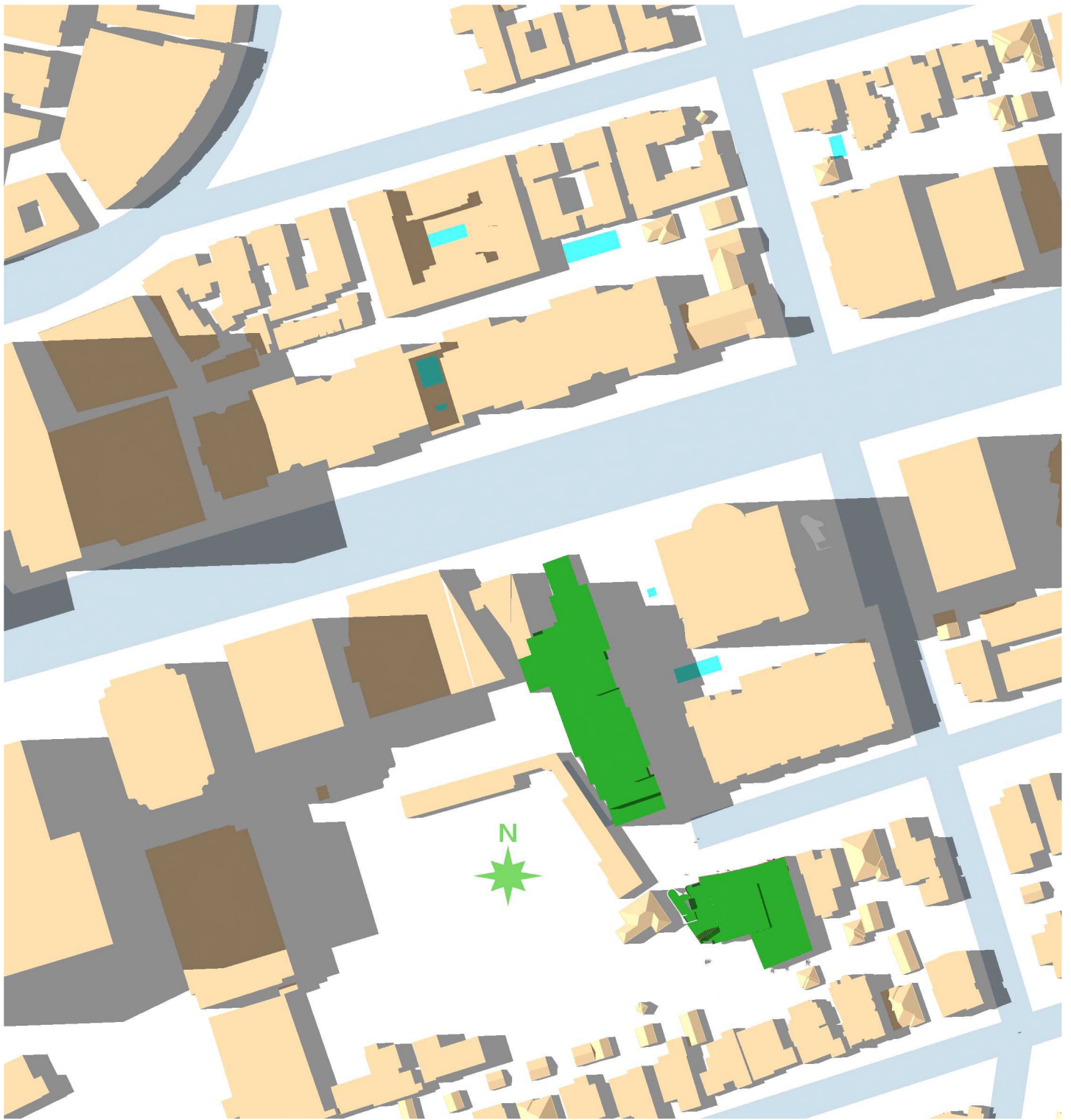
Summer Solstice Shading Diagram 3 p.m.