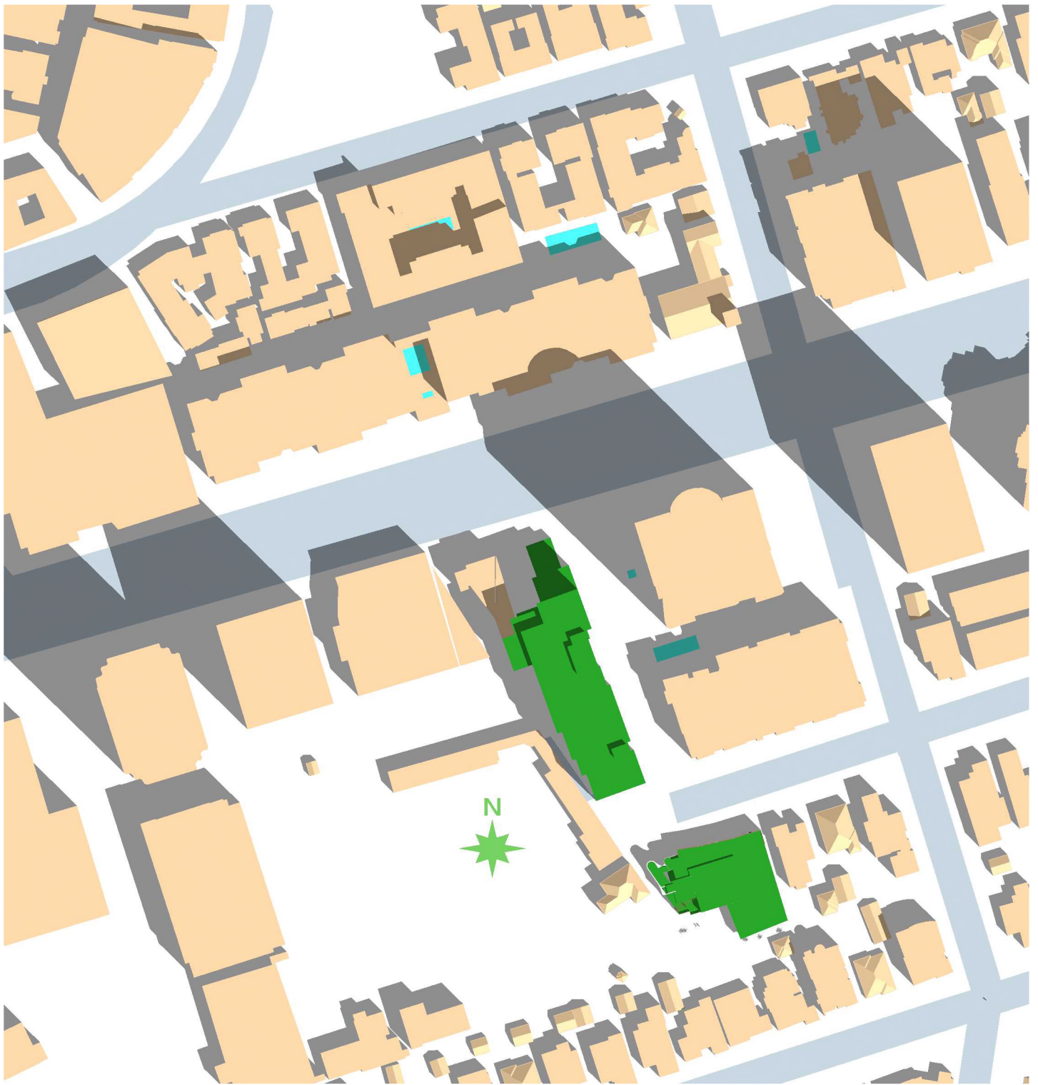
Vernal/Autumnal Equinox Shading Diagram 10 a.m.