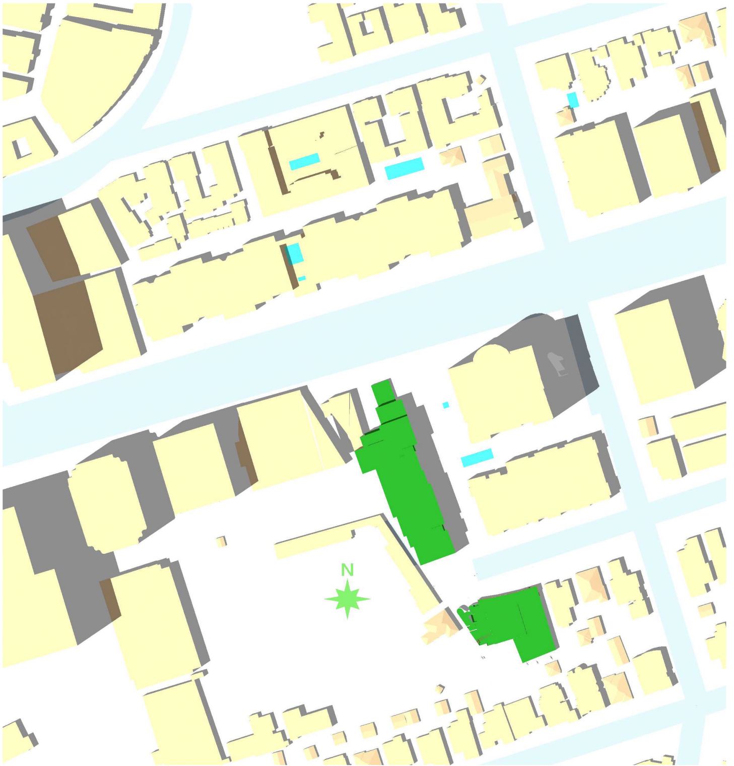
Summer Solstice Shading Diagram 1 p.m.