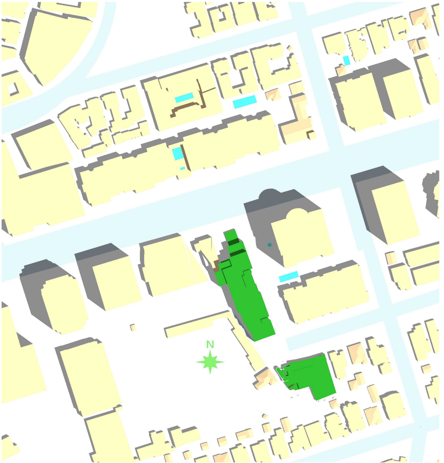
Summer Solstice Shading Diagram 11 a.m.